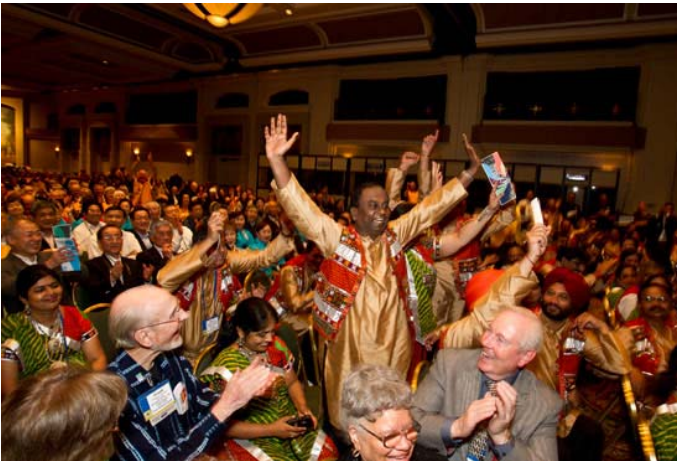
於 1 月 19 日在 2012 年國際講習會當中地區總監當選人與其眷屬們享受國際才藝之夜。

RI President-elect Sakuji Tanaka dances with Rotarians from Brazil during International Festival Talent Night at the 2012 International Assembly on 19 January.