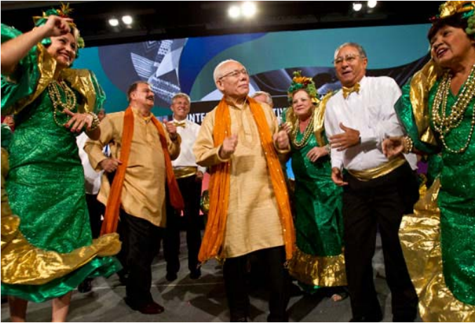
國際扶輪社長當選人田中作次於 1 月 19 日在 2012 年國際講習會國際才藝之夜當中與從巴西來的扶輪社員們一起跳舞。

RI President-elect Sakuji Tanaka dances with Rotarians from Brazil during International Festival Talent Night at the 2012 International Assembly on 19 January.