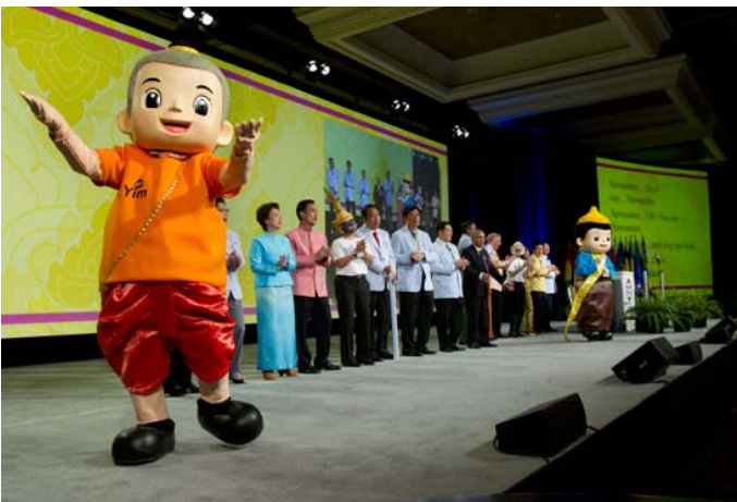
2012 年曼谷國際年會委員會的委員們於 1 月 20 日在 2012 年國際講習會的“向前去服務宴會”上領唱一首道地的泰國歌曲。 Members of the 2012 Bangkok Convention Committee lead attendees in a traditional Thai song during the Go Forth to Serve Banquet at the 2012 International Assembly on 20 January.