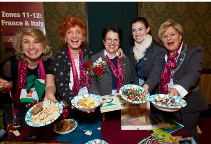
來自義大利的地區總監當選人的配偶們在 1 月 19 日 2012 年國際講習會的配偶文化交流期間給提供正統的甜點給出席者。 Spouses of district governors-elect from Italy offer traditional desserts to attendees during the Spouse Cultural Exchange at the 2012 International Assembly on 19 January.