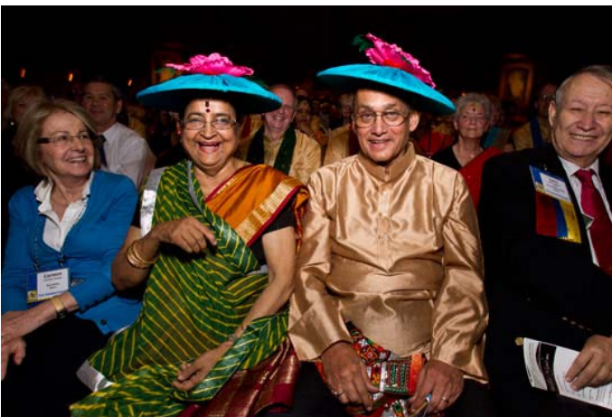
國際扶輪社長卡爾揚•班納吉和他的妻子 Binota 於 1 月 19 日在 2012 年國際講習會國際才藝之夜當中分享歡笑。

RI directors and their spouses dance to “Jai Ho,” a Hindi song, during International Festival Talent Night at the 2012 International Assembly on 19 January.