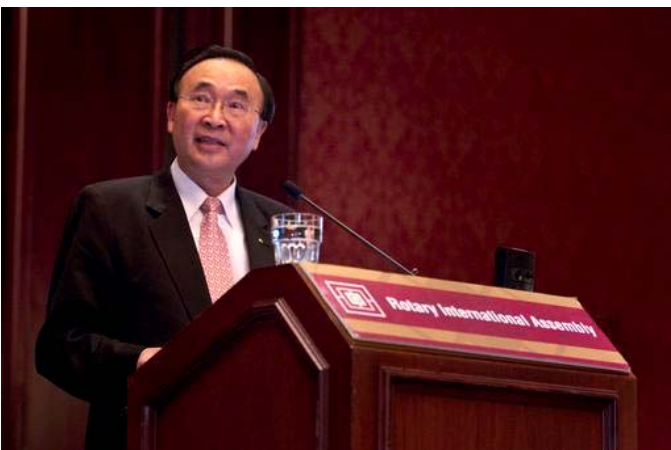
扶輪基金會的保管人謝三連在 2012 年 1 月 20 日美國加利福尼亞聖地牙哥的國際講習會的專題討論當中對地區總監當選人及其配偶們演講有關創造值得紀念的地區會議的前 10 大竅門。 TRF Trustee Jackson San-Lien Hsieh speaks to district governors-elect and spouses at the Panel: Top 10 Tips for Creating Memorable District Meetings during the International Assembly, 20 January 2012, San Diego, California, USA.