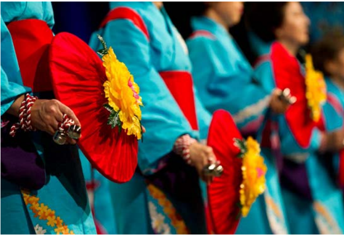
來自日本的扶輪社員們於 1 月 19 日在 2012 年國際講習會國際才藝之夜當中表演一個道地的日本舞蹈。 Rotarians from Japan perform a traditional dance during International Festival Talent Night at the 2012 International Assembly on 19 January.