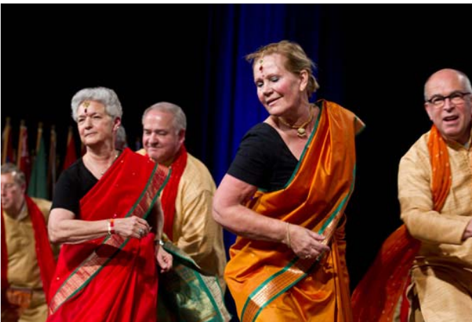
於 1 月 19 日在 2012 年國際講習會國際才藝之夜當中國際扶輪理事和他們的配偶以一首印第語歌“Jai Ho”跳著舞。

District governors-elect and their spouses enjoy International Festival Talent Night at the 2012 International Assembly on 19 January.