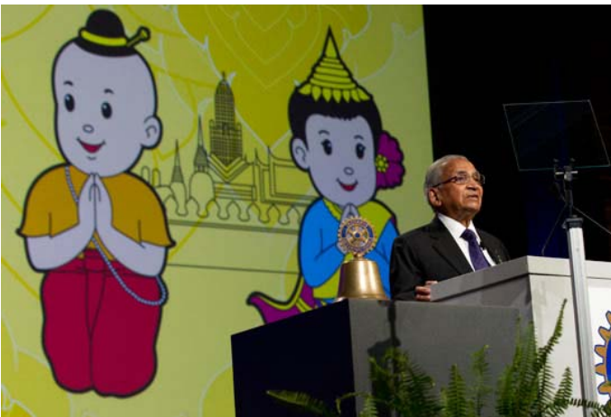
2012 年曼谷國際年會委員會主委 O.P. Vaish, 於 1 月 20 日在 2012 年國際講習會的“向前去服務宴會”上鼓勵扶輪社員們前往參加國際年會。 O.P. Vaish, chair of the 2012 Bangkok Convention Committee, encourages Rotarians to attend the convention during the Go Forth to Serve Banquet at the 2012 International Assembly on 20 January.